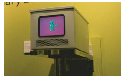
FACT, UNITED KINGDOM 2004