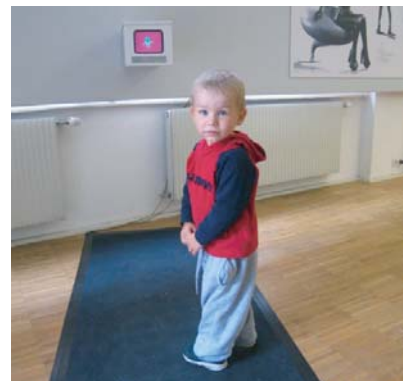
ARS ELECTRONICA, AUSTRIA 2005