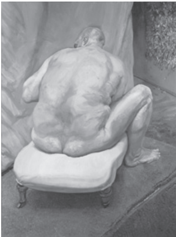
Lucian Freud, Naked Man, Back View, 1991-1992. Oil on canvas, 183.5 × 137.5cm.