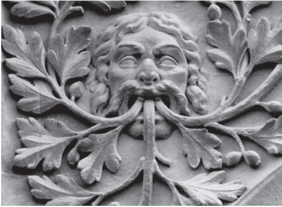
Green man. Pembroke St., Cambridge, UK

Nature is made better by no mean But nature makes that mean: so, over that art Which you say adds to nature, is an art That nature makes. You see, sweet maid, we marry A gentler scion to the wildest stock, And make conceive a bark of baser kind By bud of nobler race: this is an art Which does mend nature, change it rather, but The art itself is nature. 10