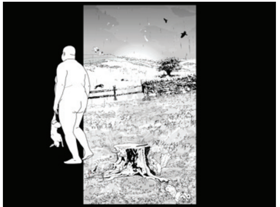
Marina Zurkow, still from Mesocosm (Northumberland UK), spring (2011)

Mesocosm is a video animation representing the passage of one year on the moors of Northumberland, UK. 9 One hour of world time elapses in each minute of screen time, so that a complete cycle lasts 146 hours: "Seasons unfold, days pass, moons rise and set, animals come and go," around a centrally located and almost omnipresent human figure. The figures that appear suggest an open, even infinite, set of beings and phenomena, unconstrained by taxonomic limits: there are cows, owls, ravens, squirrels, foxes, men, women, children, humans in animal costumes, butterflies, refugees, caterpillars, swarms of insects, bats, rabbits, dumpsters, trucks, steamrollers, vans, calves, dogs, hares, fairies, dragonflies, inchworms, midges, spiders, hikers, bikes, horses, ponies, sheep, lambs, swallows, clouds, smokestacks, fog, pollen, shadows, garbage, leaves, petals, pollen, snow, rain, sleet, and wind. This is indeed, as the artist says in her notes on the work, "an expanded view of what constitutes 'nature.'" It is also a capacious rendition of umwelt , staging the endless communicative events and interactions that shape the experience of human and other animals.