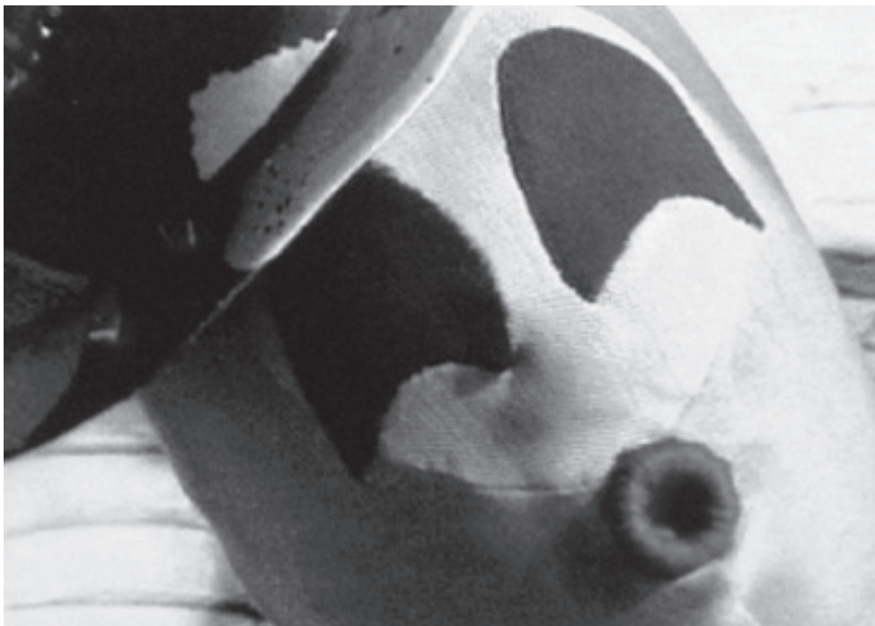
Charles Atlas. The Legend of Leigh Bowery. USA/France, 2002. 88 min.

But as Gordon Rogoff puts it, theatre is not safe—or rather, its special power is squandered in producing illusions of distance, separation, and protected privilege. 17